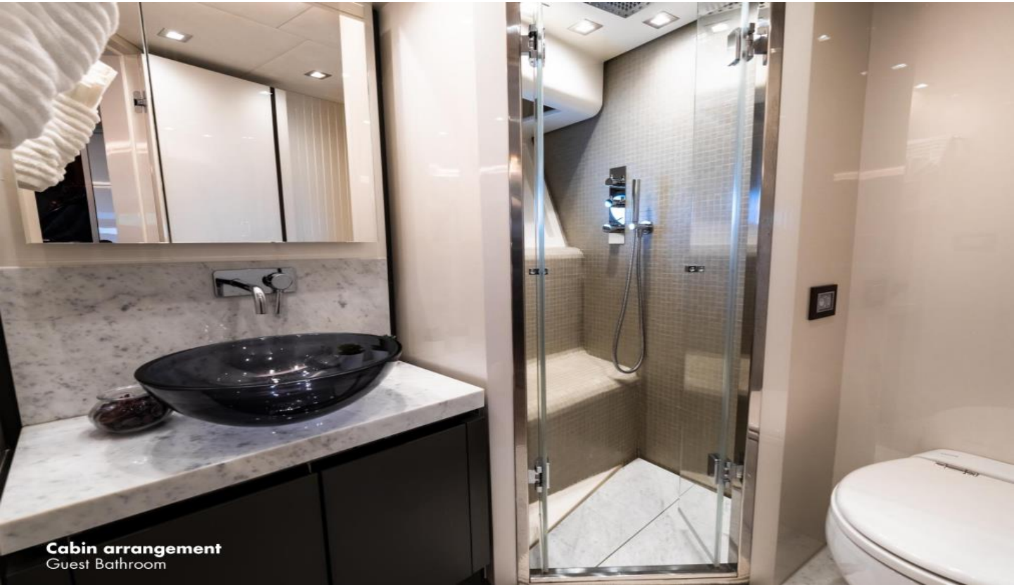
Cabin arrangement Guest Bathroom