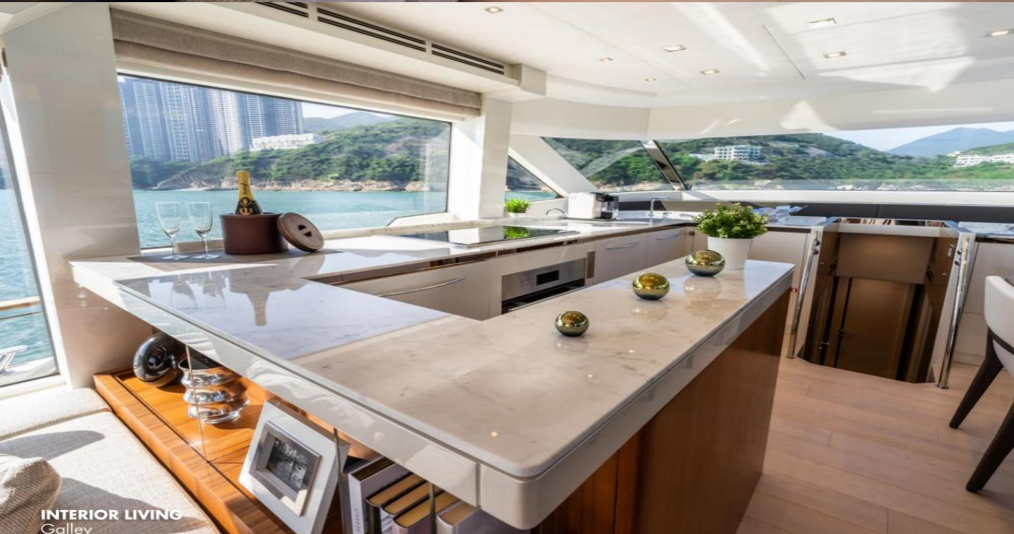
INTERIOR LIVING Galley