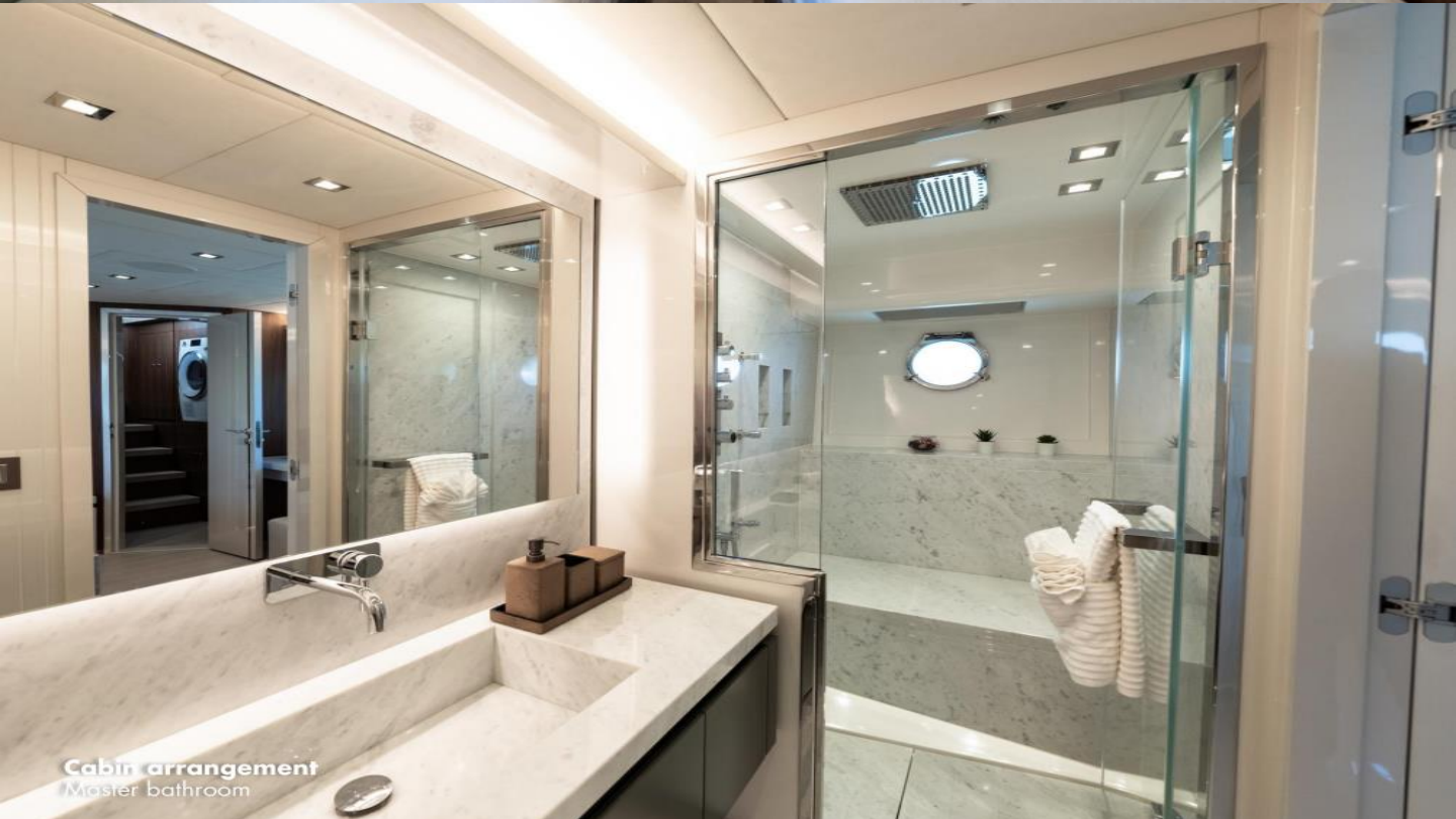
Cabin arrangement Master bathroom