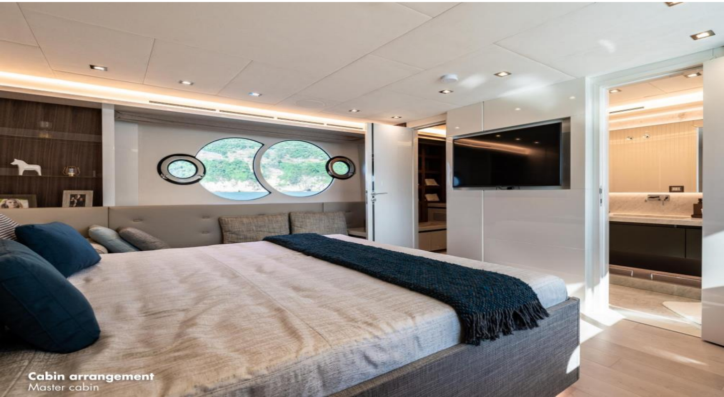
Cabin arrangement Master cabin