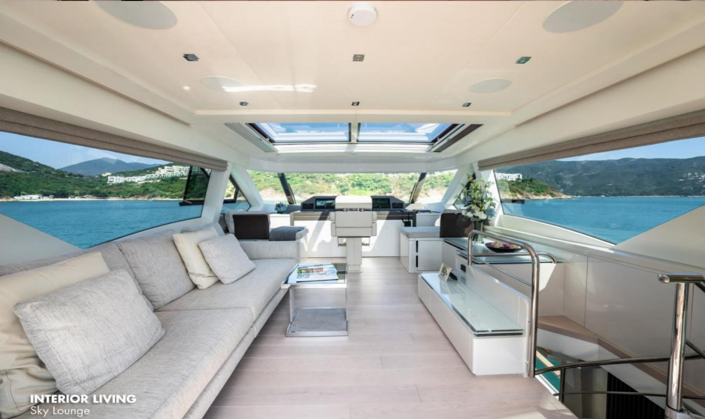
INTERIOR LIVING Sky Lounge