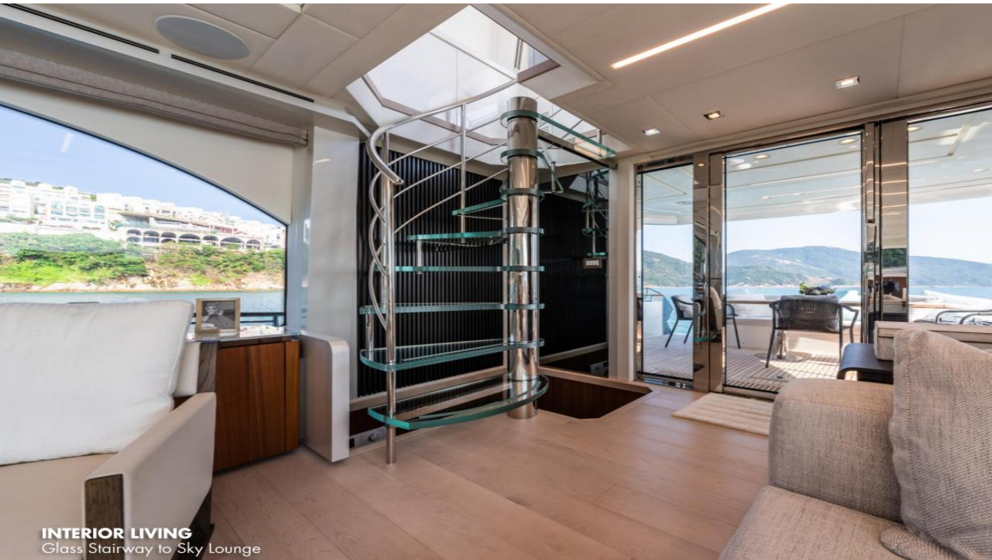
INTERIOR LIVING Glass Stairway to Sky Lounge