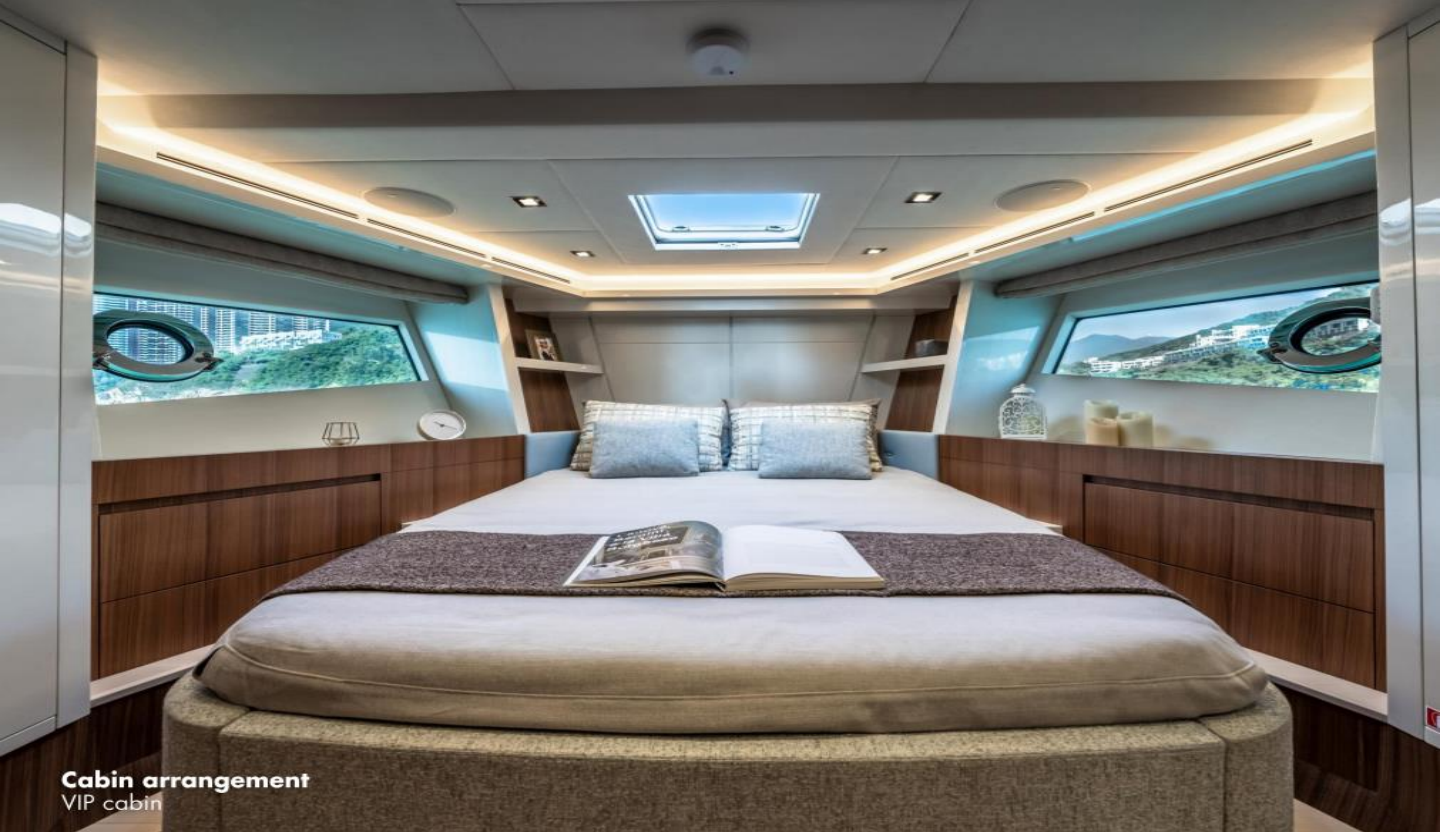
Cabin arrangement VIP cabin