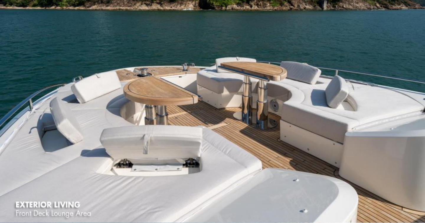
EXTERIOR LIVING Front Deck Lounge Area