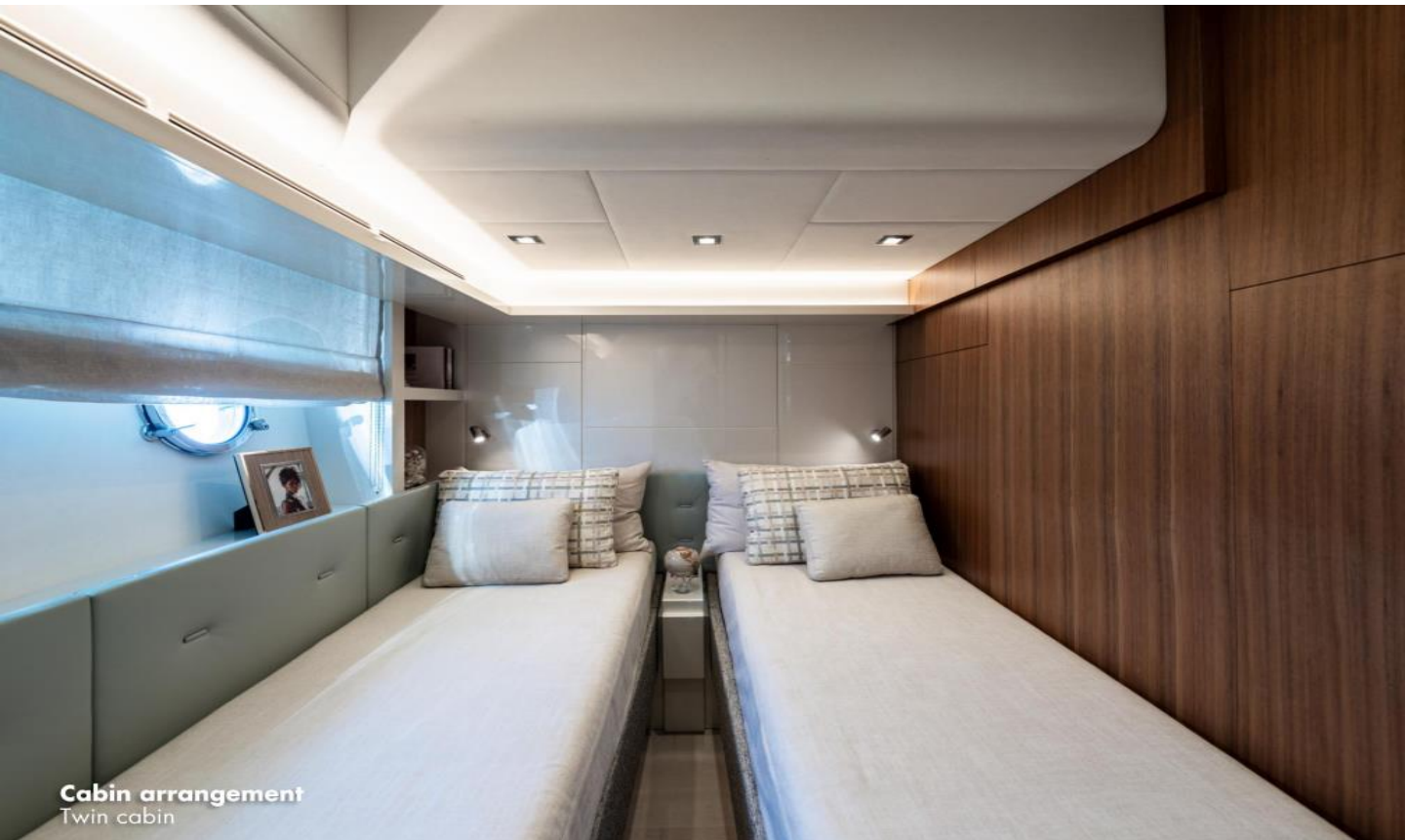
Cabin arrangement Twin cabin