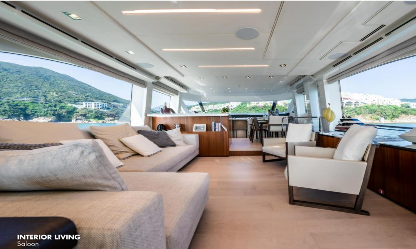
INTERIOR LIVING Saloon