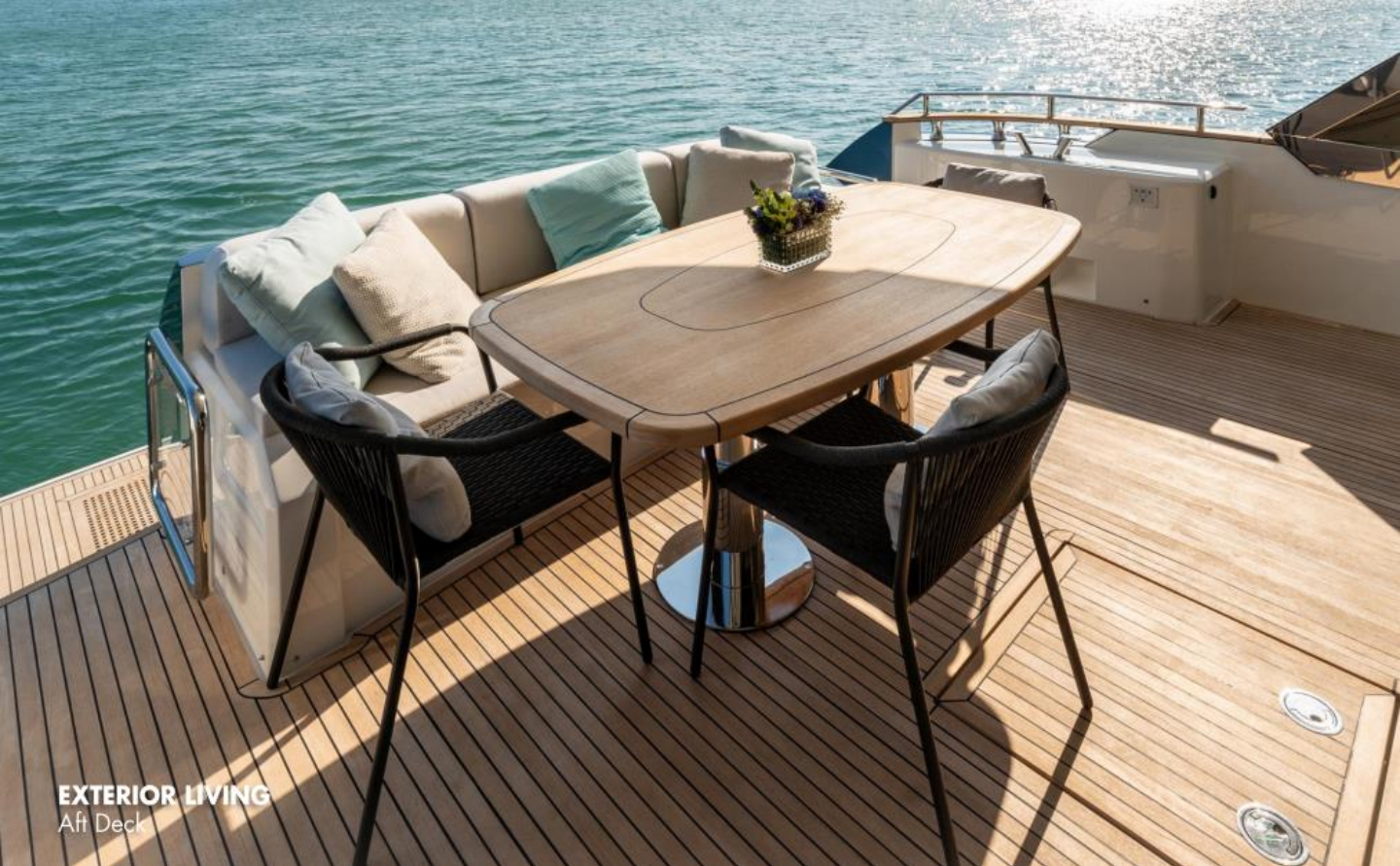
EXTERIOR LIVING Aft Deck