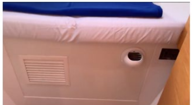
Airconditioning in all 4 cabins