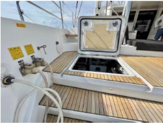
Port Engine Room