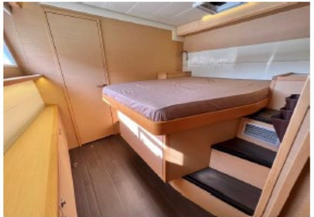
Port Forward Cabin