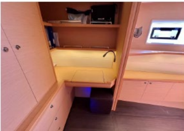
Port Forward Cabin