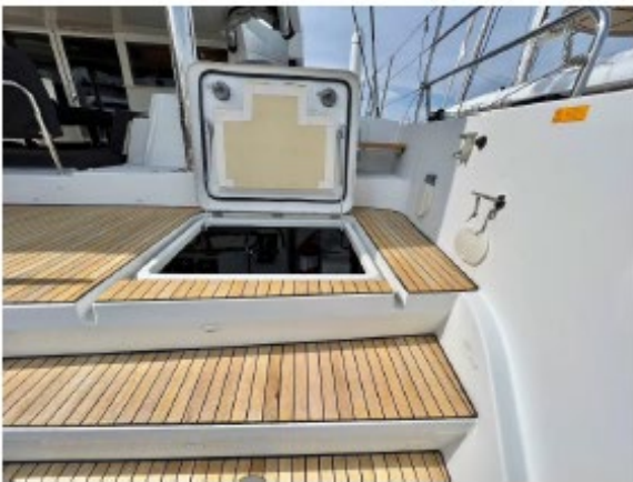
Starboard Engine Room