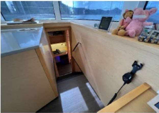
Port Forward Cabin