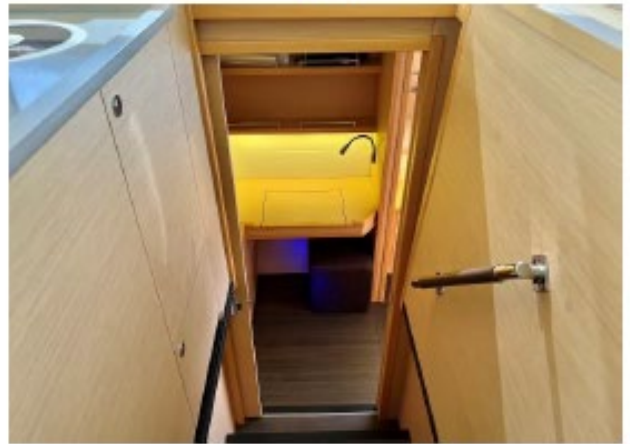
Port Forward Cabin