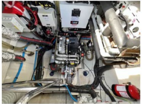
Port Engine Room