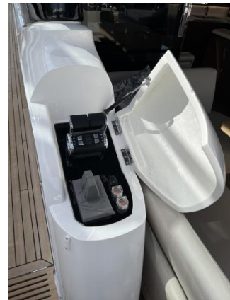
3 rd Station Controls