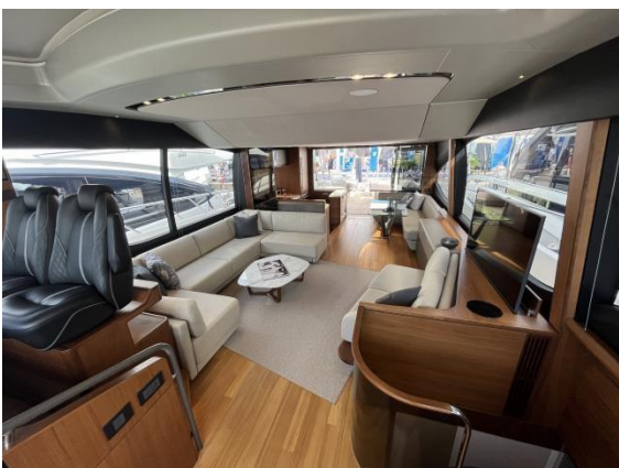
Saloon (Looking Aft)