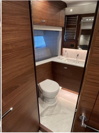
Port Cabin Bathroom