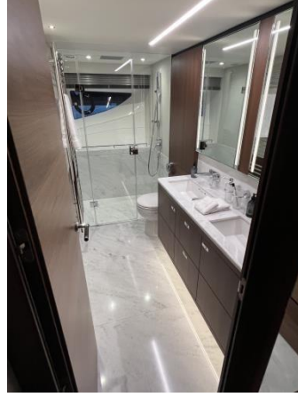
Master Cabin Bathroom