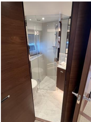
Forward Cabin Bathroom