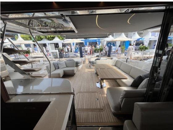
Cockpit (Looking Aft)