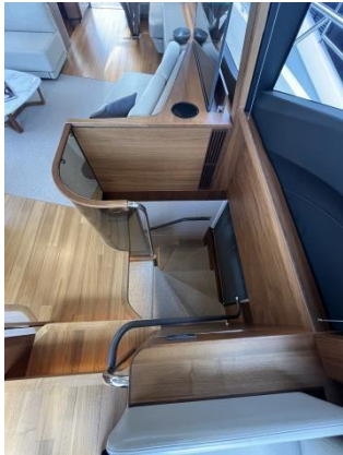
Stairwell to Master Cabin