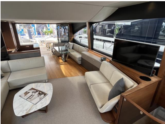
Saloon (Looking Aft)